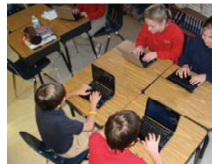
Sixth grade students working with their Netbooks

dents that will truly set the bar for future technology initiatives in our school," says Queen of Apostles Principal,