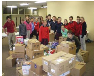
Grade 8 collected over 2,000 food items for Pewaukee Food Pantry

The food drive has been conducted for many years. Queen of Apostles School is one of the largest contributors to the pantry.