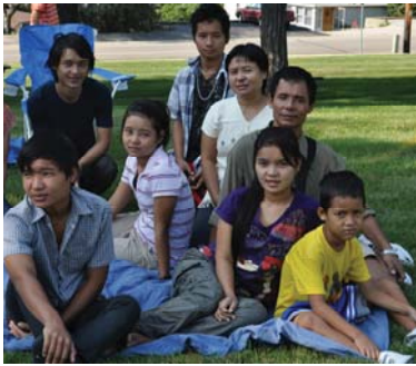
Our Salt and Light Outreach Program asked students and their families to help sponsor items for our refugee families .

During the month of September, students donated bars of soap, shampoo, toothpaste and toothbrushes. In October, socks, were collected. In November, Q of A School collected canned vegetables and fruit, and grocery store gift certificates to help buy turkeys for our refugee family. In December, jammies, socks, tea and hot chocolate were donated. During the month of January, new underwear was collected. In February, students collected Jasmine Rice.